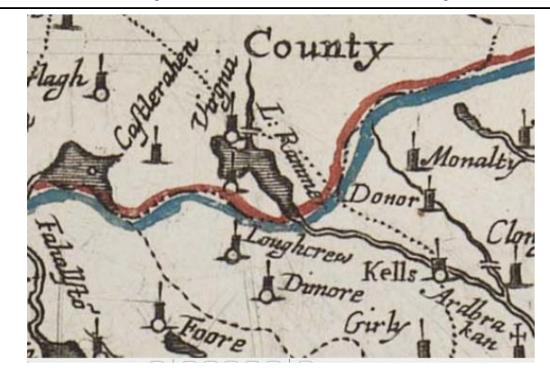
Part of a map showing THE DOWN SURVEY OF IRELAND.

The Munterconnaught area comprises just fourteen townlands. However, in past centuries, there were several other townlands, the names of which have long fallen into disuse and which have been subsumed into adjoining townlands. The names are mentioned in documents such as the Patent Rolls of King James the First (1604) and the Jacobite grants of 1612. Some of the